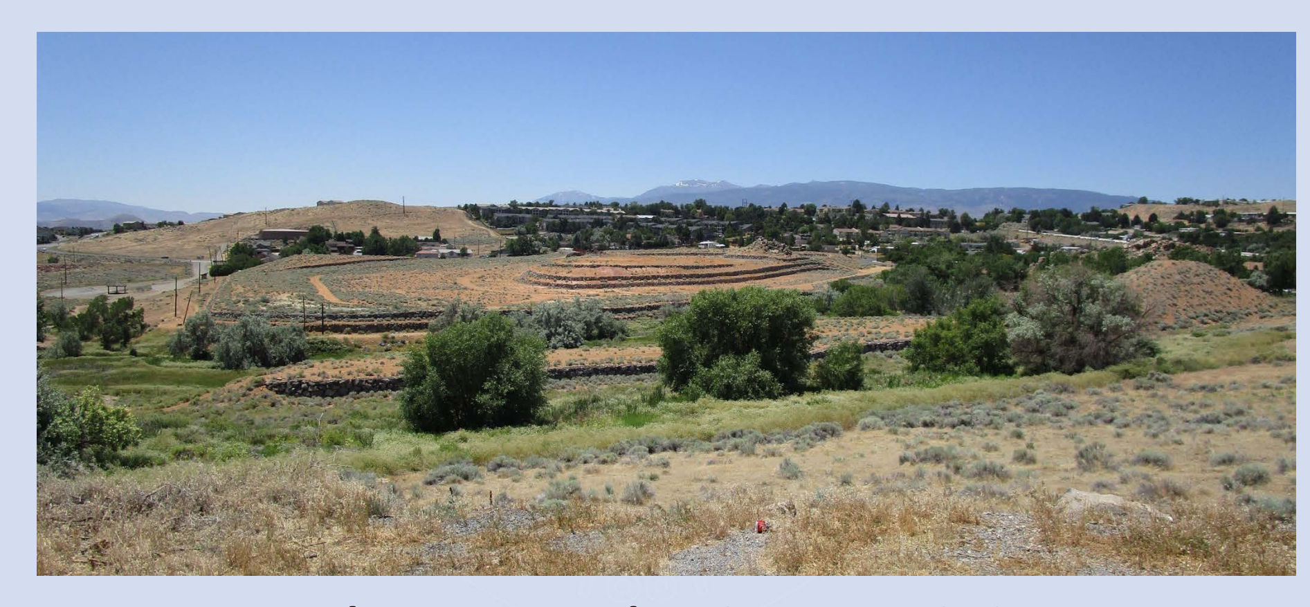
Washoe County Planning Commission August 7, 2018